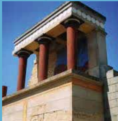
Archaeological site of Knossos