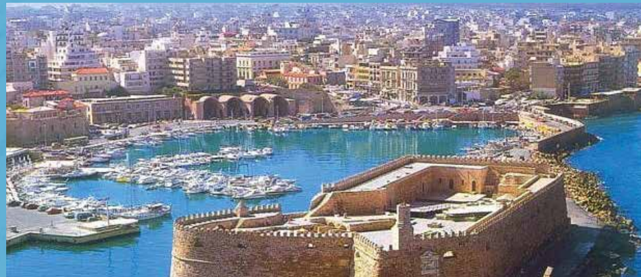
Venetian port of Heraklion