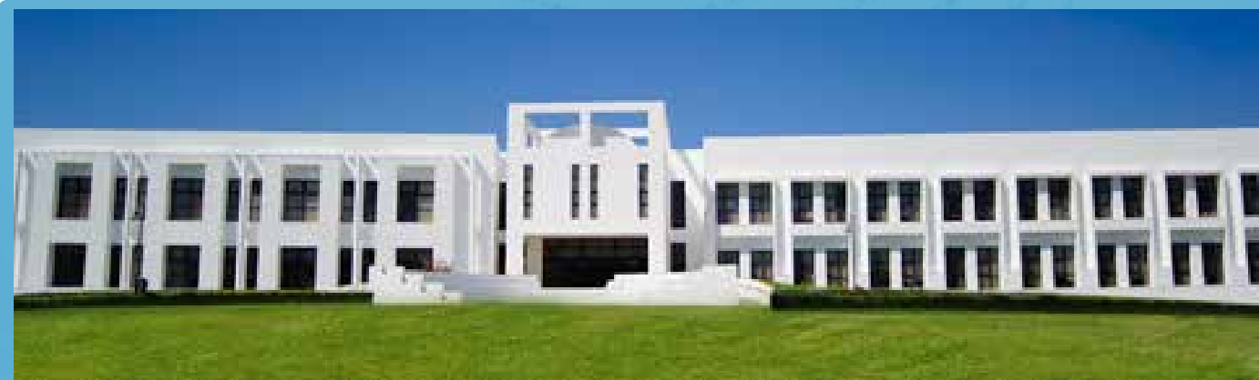
Foundation for Research and Technology - Hellas (FORTH)